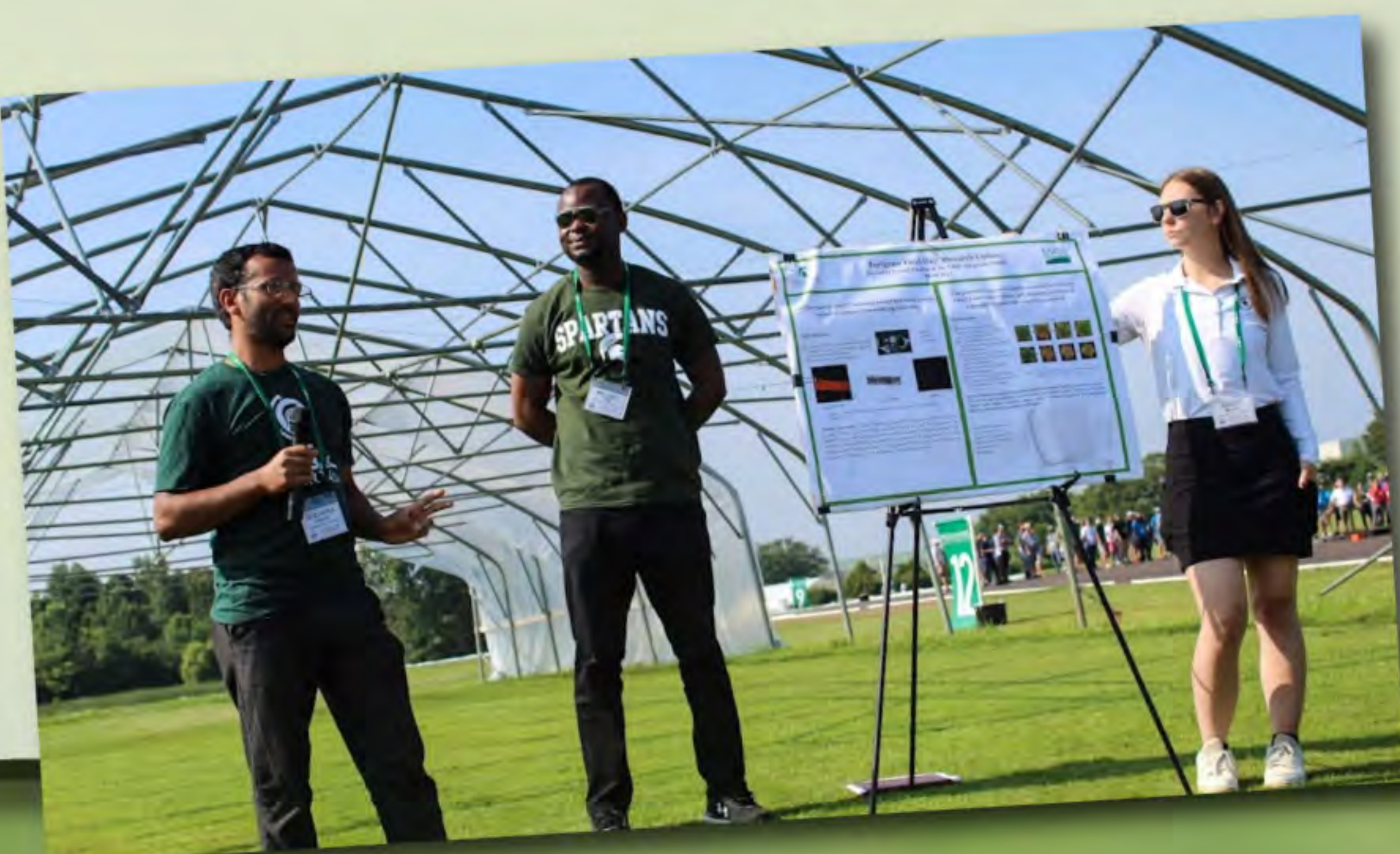
Photo highlights from Wednesday's MSU Turfgrass Field Day! Thank you all the professors, grad students, attendees and sponsors who made it such a great day.